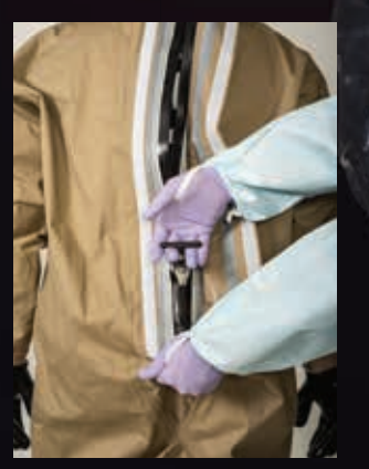
Easy to hold rear zipper aids donning and doffing ergonomics.