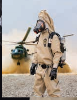
Tan color option is often preferred for Military use.