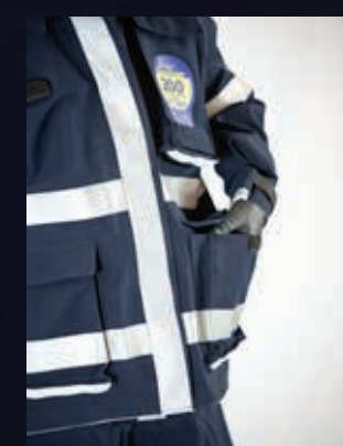
Pockets and equipment loops are popular customizations.