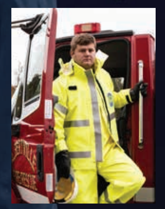
Firefighters can reduce use of expensive turnout gear.