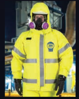
DuraChem 200 is also ideal for industrial work.

Complete technical and chemical test data for the DuraChe