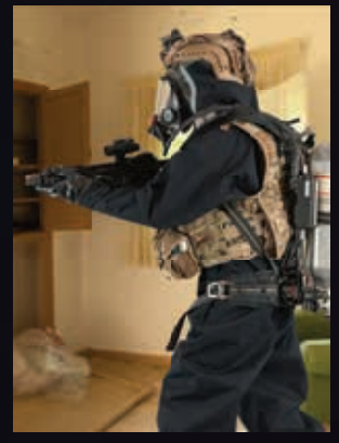
Tactical style garment for law enforcement and military use.